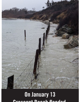
Crescent Beach flooded.

Even in winter, hundreds of people enjoy walking along the Knob's access path and adjacent trails. In the summer, visitors number in the thousands. The work on the Knob has been staged to permit continued active use of the Knob by its admirers.