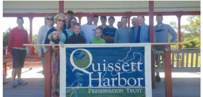
Volunteers gather for Beach Clean-up.